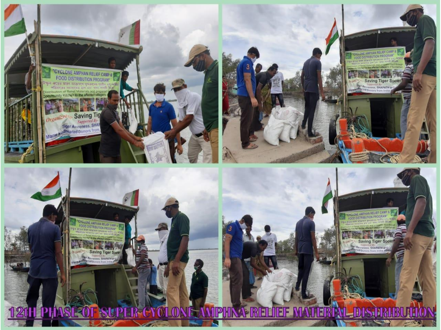
12 th phase of Cyclone Amphan Relief work at Kalidaspur Village, Kalidaspur G.P, Mollakhali P.S Distribution : Bleaching powder 200 kgs and Lime (chuna) 400 kgs for sanitation purposes