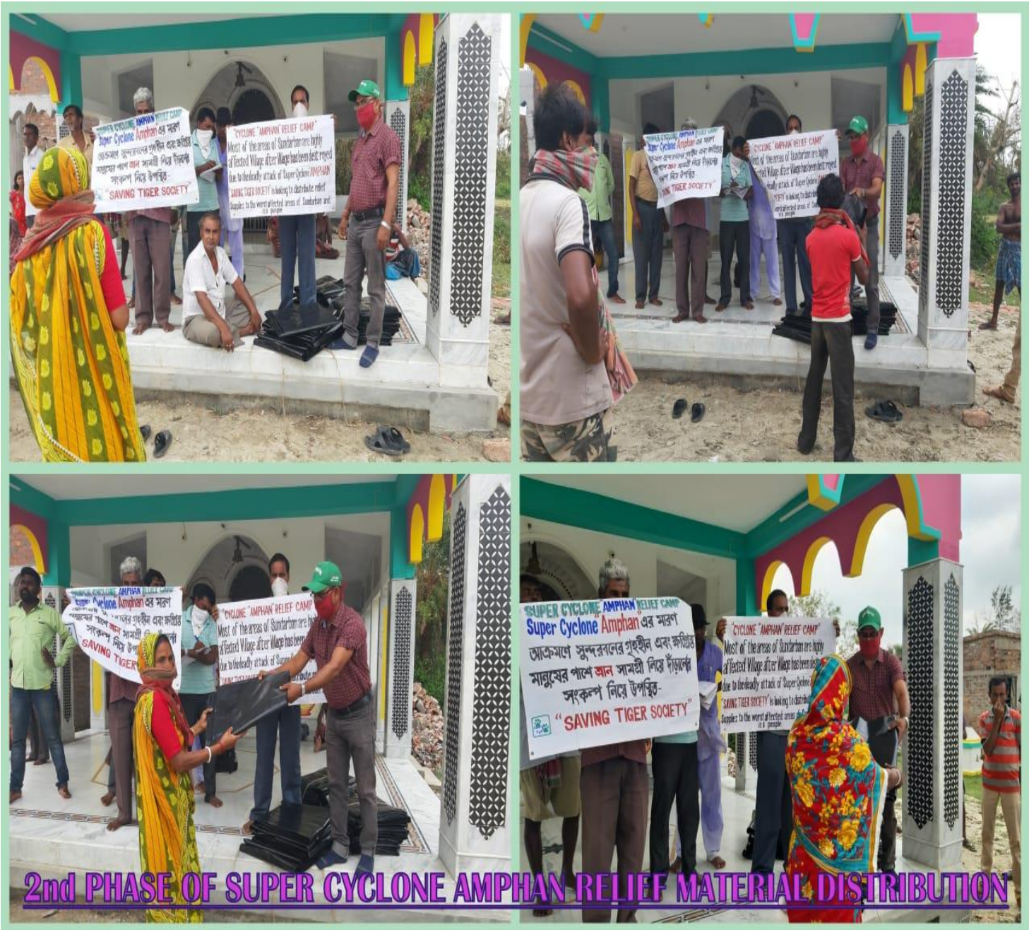
2 nd Phase of Cyclone Amphan Relief work at Tridipnagar, Jharkhali G.P under Jharkhali Coastal P.S Distribution : Tarpaulin sheets to 50 pax