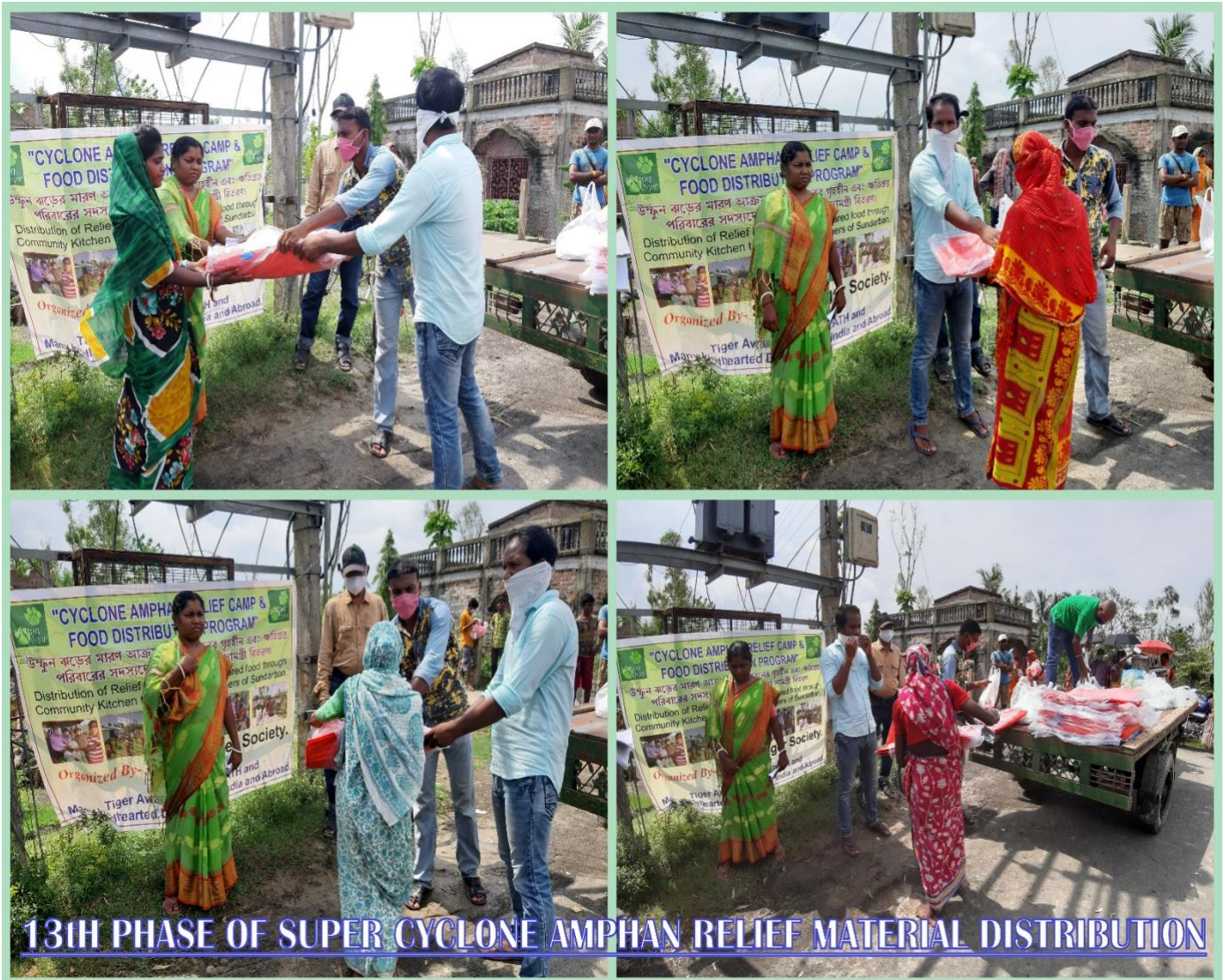
13th PHASE OF SUPER CYCLONE AMPHAN RELIEF MATERIAL DISTRIBUTION

13 th Phase of Cyclone Amphan Relief work at Choudhury More (riverside area), Jharkhali G.P under Jharkhali Coastal P.S Distribution : Tarpaulin sheets, bleaching powder, lime (chuna), dry food kits to 50 pax