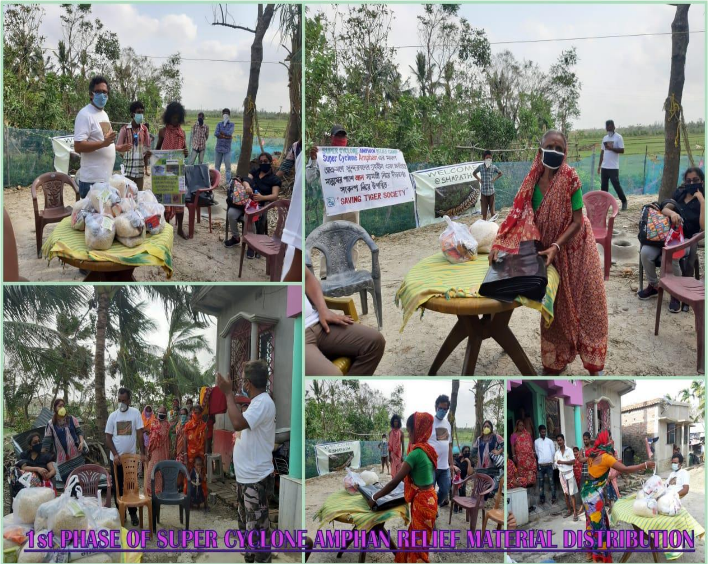
1 st Phase of Cyclone Amphan Relief work at Master Para, Jharkhali G.P under Jharkhali Coastal P.S Distribution : Tarpaulin sheets and dry food kits to 30 pax