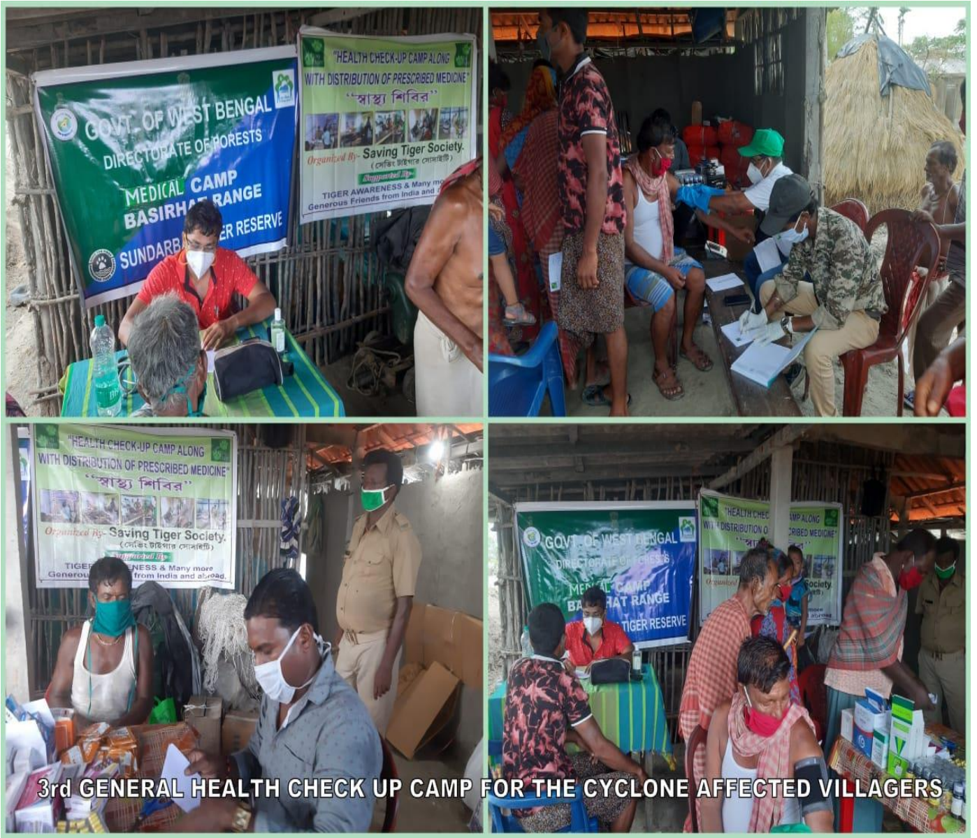
3 rd General Health check up camp for Cyclone Amphan Relief work at Basirhat Range, Kalidaspur G.P, Mollakhali P.S