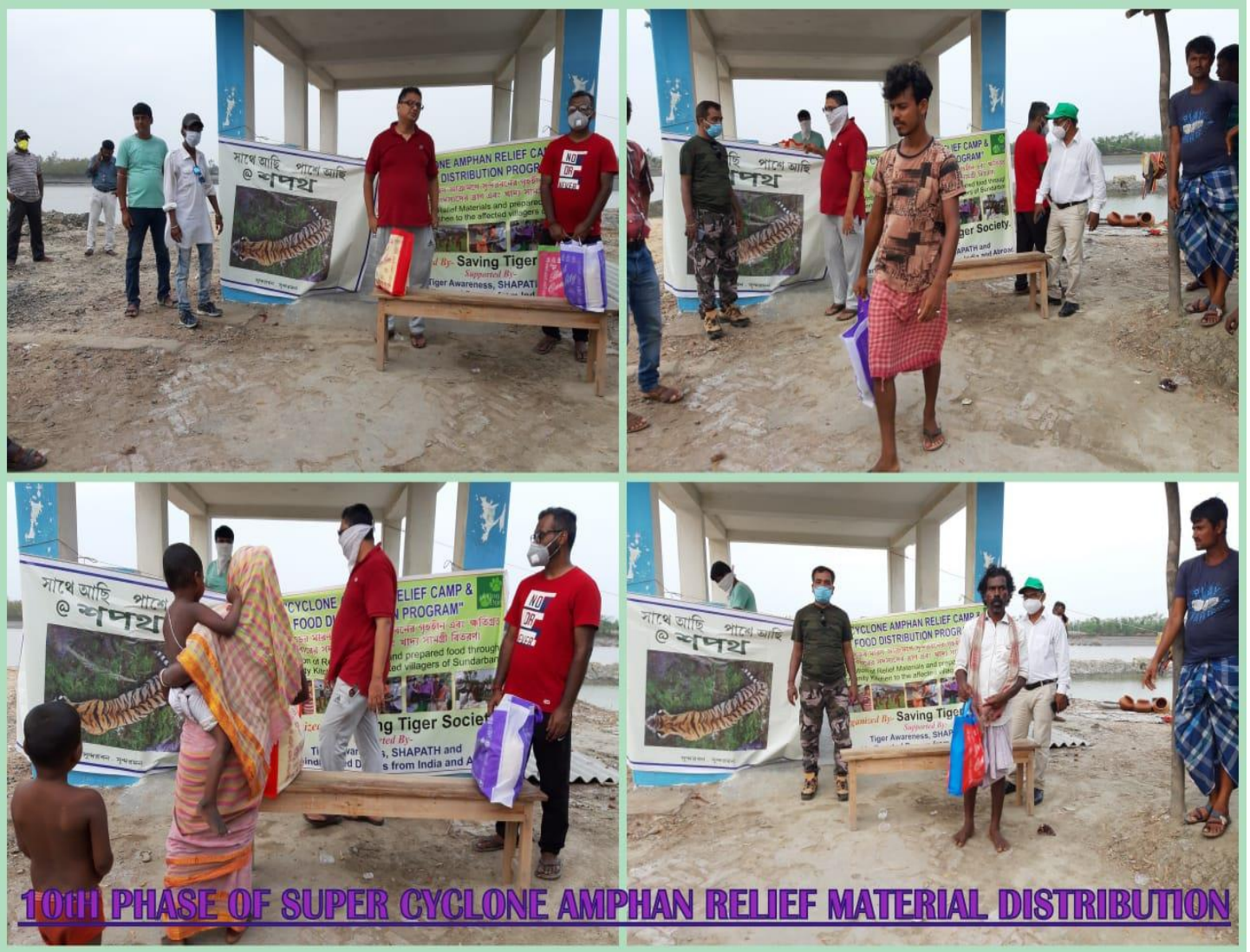
10 th Phase of Cyclone Amphan Relief work at Tejokhali Village, Chunakhali G.P, Basanti P.S Distribution : Dry Food Rations to 60 pax