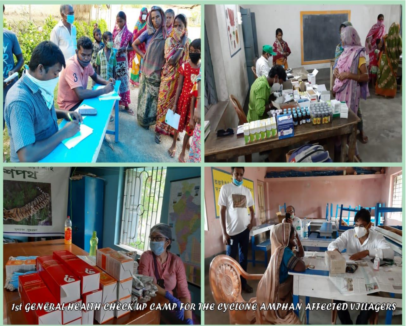
1 st General Health check up Camp for Cyclone Amphan Relief work