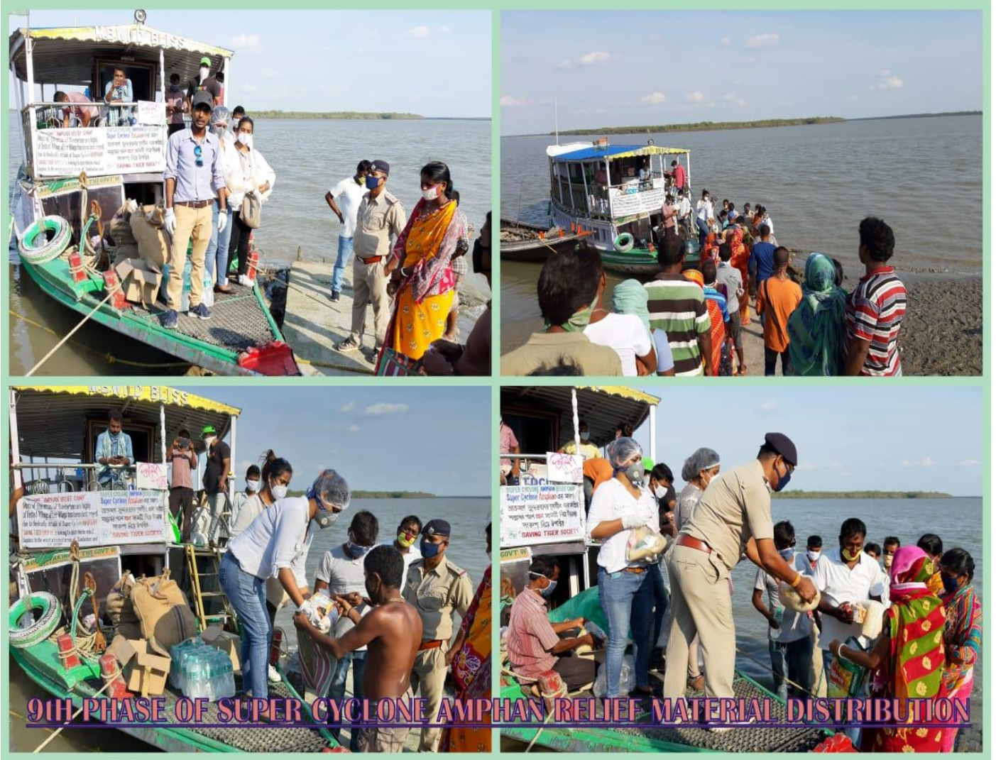
9 th Phase of Cyclone Amphan Relief work at Morijhapi Village, Choto Mollakhali G.P, Mollakhali P.S Distribution : Dry food rations to 200 pax