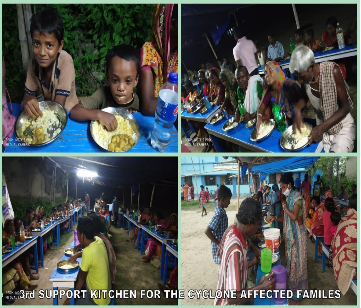
3 rd Cyclone Amphan Relief work Support Kitchen at Jana Para, Chunakhali G.P, Jharkhali P.S Distribution : Cooked food served to 200 pax