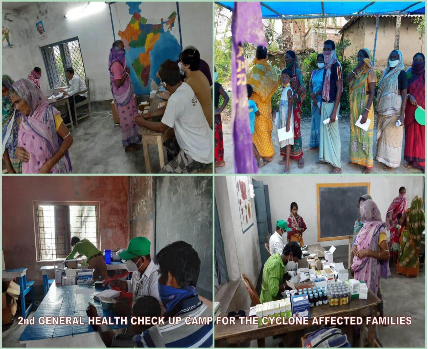
2 nd General Health check up camp for Cyclone Amphan Relief work