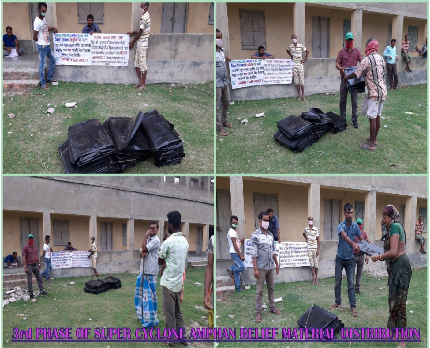
3 rd Phase of Cyclone Amphan Relief work at Gangamela Village, Jharkhali G.P under Jharkhali Coastal P.S Distribution : Tarpaulin sheets to 50 pax