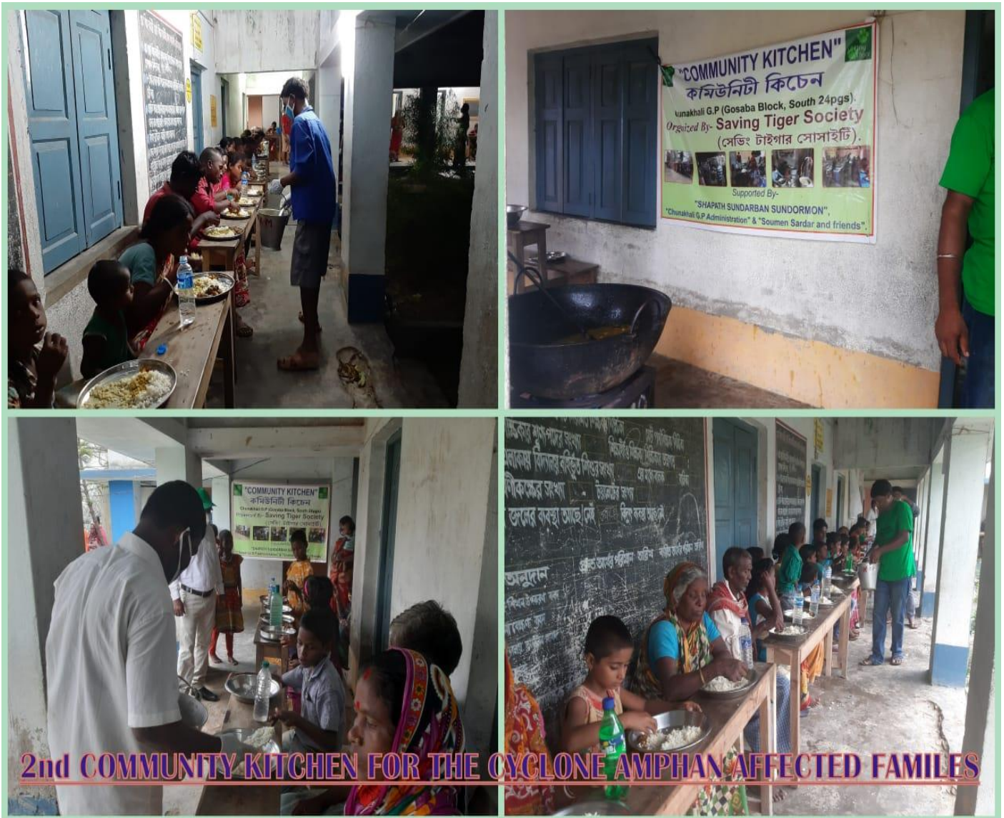
2 nd Cyclone Amphan Relief work Support Kitchen at Nafargunj Village, Nafargunj G.P under Jharkhali Coastal P.S Distribution : Cooked food served to 120 pax