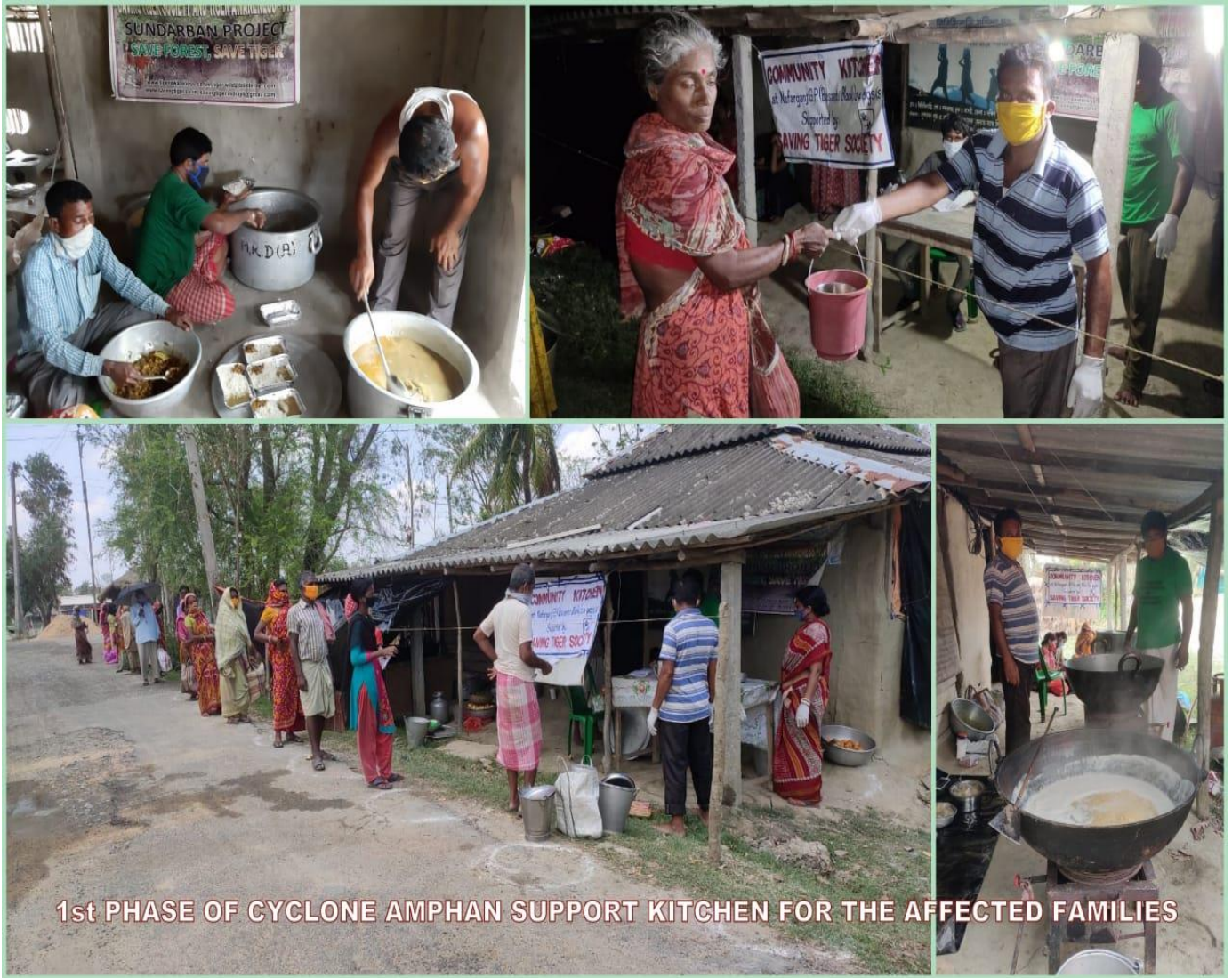
1 st Cyclone Amphan Relief work Support Kitchen at Chunakhali, Chunakhali G.P, Jharkhali P.S Distribution : Cooked meals served to 200 pax