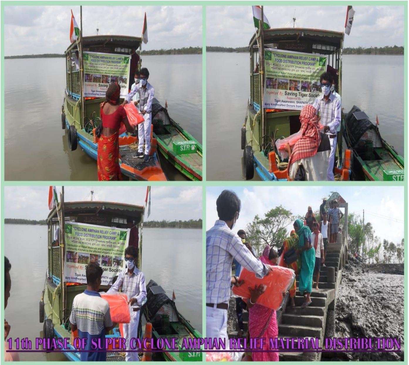
11 th Phase of Cyclone Amphan Relief work at Pancharam er Ghat, Kalidaspur G.P, Mollakhali P.S Distribution : Tarpaulin sheets to 200 pax