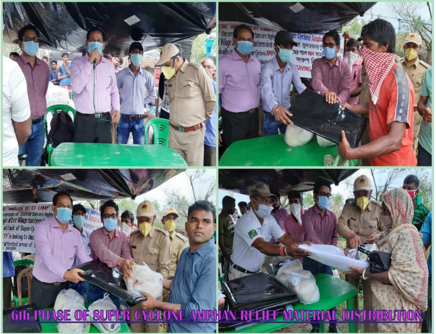
6 th Phase of Cyclone Amphan Relief work at Dhulki Forest Village, Sundarbans Tiger Reserve Distribution : Tarpaulin sheets and dry food kits to 200 pax